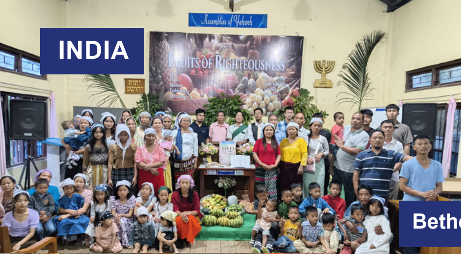
Bethel, New Lamka